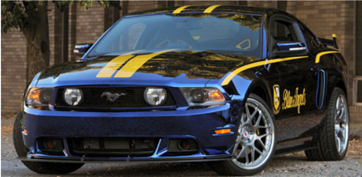
“Blue Angels” edition 2012 Ford Mustang

VINTAGE PHOTOS WANTED! Mustang Monthly magazine is looking for vintage Ford dealer photographs for an upcoming feature in a future issue. They are asking to borrow pictures or get scanned originals. If you can help, and want to send scanned pictures, email them to donald.farr@sorc.com . If you are willing to mail them some to borrow, send them to: Donald Farr, Mustang Monthly, 9036 Brittany Way, Tampa, FL 33619. The photos will be scanned and returned. Be sure to include information about the dealership, if possible.