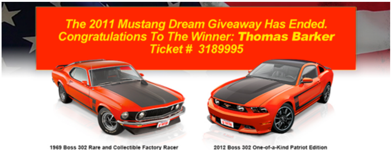
1969 Boss 302 Rare and Collectible Factory Racer

Glucker, Jeff. "24-year-old wins pair of Ford Mustang Boss 302 coupes." 27 July 2011. Web. 28 July 2011. < http://www.autoblog.com/2011/07/27/24-year-old-wins-pair-of-ford-mustang-boss-302-coupes/ >